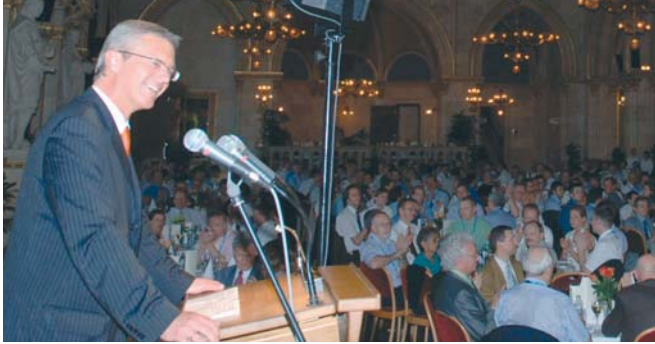
Eduard Mainoni, Secretary of State BMVIT, Austria, during the Congress Banquet in the Town Hall of Vienna.

A special contest for students was another highlight. Altogether, over 800 participants of more than 30 nations attended the three-day Aeronautics Days 2006 Conference, the largest gathering of its kind in Europe. The DGLR as the representative of CEAS in the organisation showed impressively how important a European network of specialist like CEAS is for the success for the Air & Space branch in Europe and worldwide. CEAS is looking forward to the next events in cooperation with the EC.